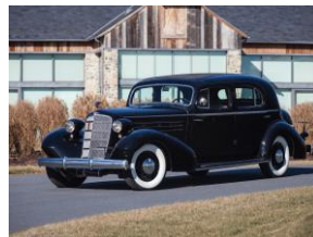
1935 Cadillac Sedan